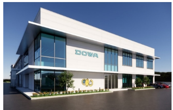
Conceptual drawing of Act-B's branch plant