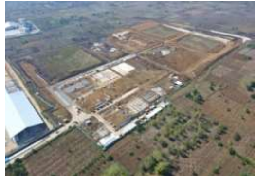
Progress of construction (photographed in October 2021)

DOWA ECO-SYSTEM CO., LTD. entered Southeast Asia in FY2008 and now runs the Environmental Management & Recycling Business, including appropriate waste treatment and waste recycling, in the four countries of Indonesia, Thailand, Singapore, and Myanmar.