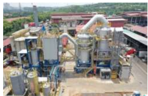
Appearance of the equipment (photographed in October 2021)